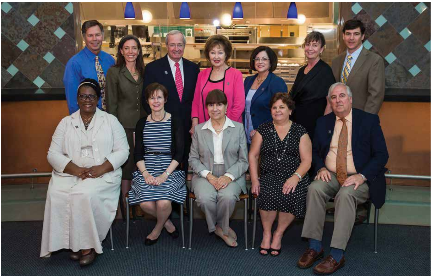
TTC Foundation recognized donors who have made a commitment to TTC’s future through planned gifts at the first annual Legacy Society Luncheon on May 21 in the Relish Restaurant Group Dining Room on Main Campus.