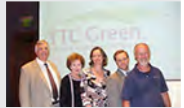
TTC Green page 5