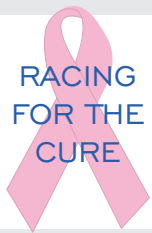
Student Nurses Race for the Cure page 2