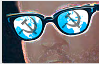
Last Call for Blackford Oakes Review page 3