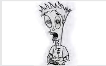
MMorpg Review page 4