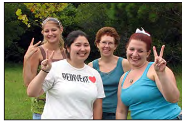
Roots and Shoots page 6