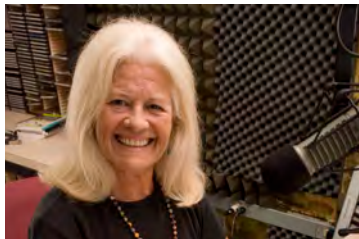
Radio Launch page 4