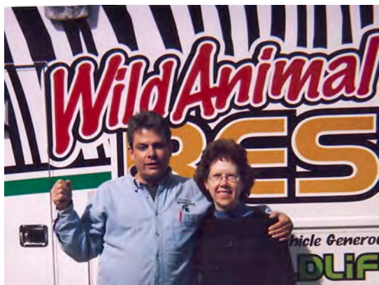
Top Picture: Roots and Shoots Team at Peaqce Day 2008 - Huntington Beach State Park.

I joined R&S at the recommendation of a friend who told me that this group could use my talents. I had been an active member of another group for about three years and during that time, the opportunities for involvement in projects had declined in part due to my schedule and in part because of the evolution of the group itself. My friend was right; there have been many opportunities to participate and utilize my talents since I joined.