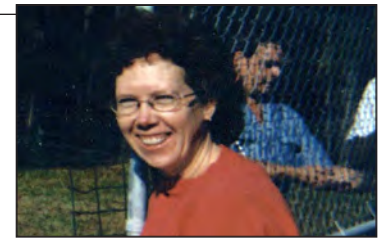
Advisor Spotlight page 7