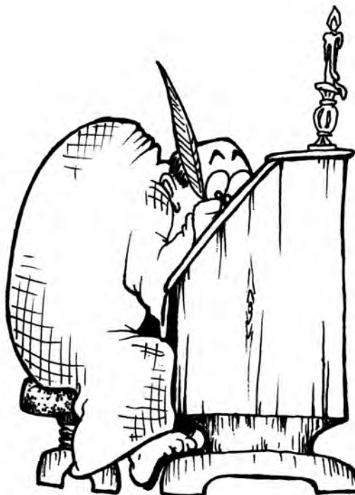
Illustration by Justin Cammer

Class members format the paper, create illustrations to accompany specific articles, and have provided photographic coverage of student events. Their combined efforts have helped this paper move to a new level of readability. ●