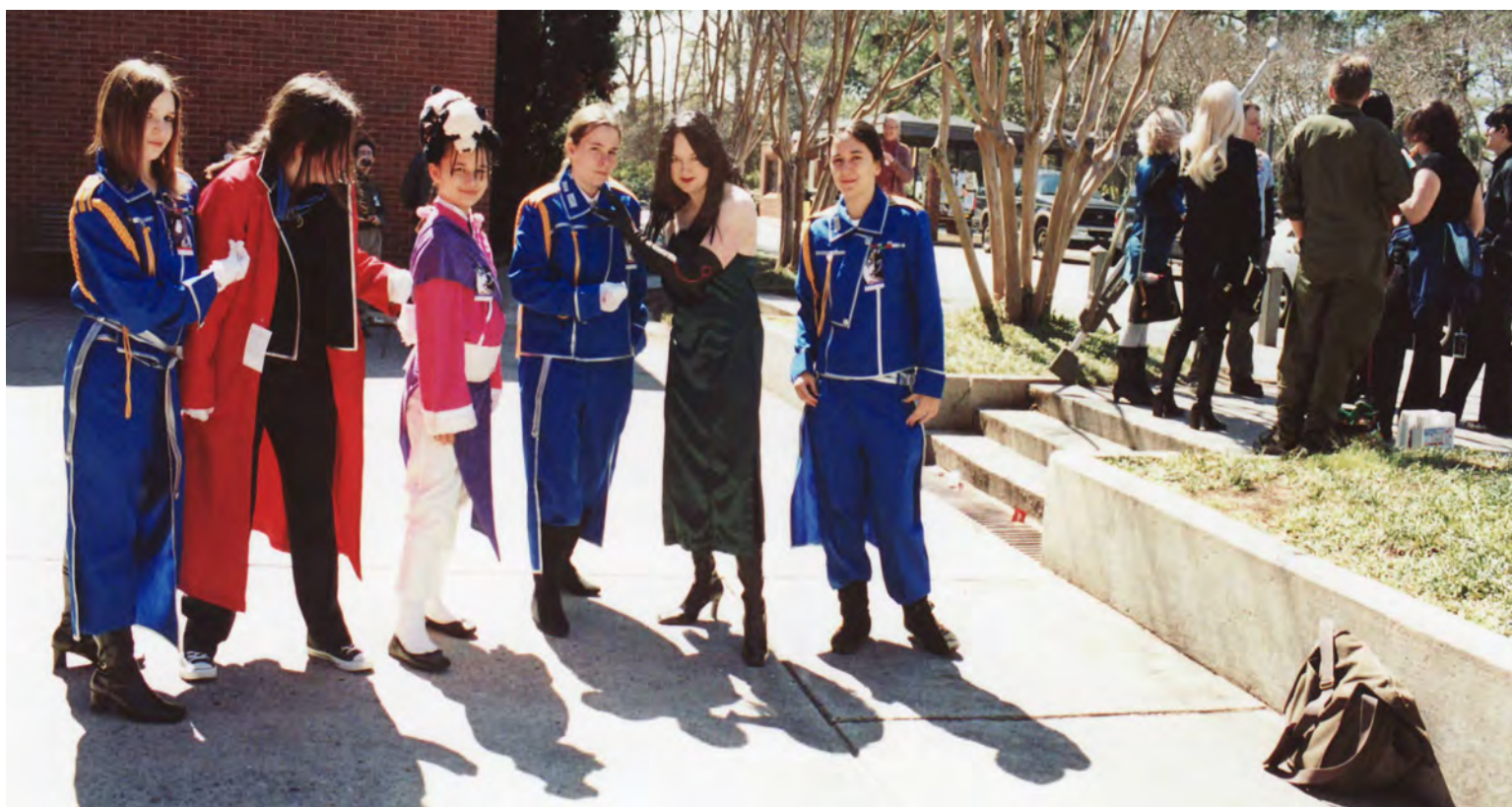
JAEC Club Members at MoMocon Convention.