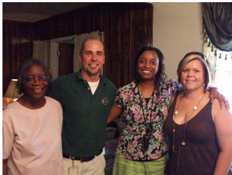
PTK members at Nichols House.

Overall, through the combined efforts, we collected 1213 books and 201 canned good items. All of our donations went to the following charities: The Jenkins Orphanage, the MUSC Children's Hospital, Department of Social Services, My Sister's House, Crisis Ministries, Nichol's Residential Care, and Magnolia's Assisted Living.