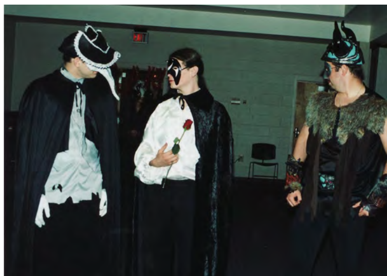
Masquerade Ball 2007.

event of the convention. Man I tell ya!, they love to compete against one another. The whole reason I went on the trip was to have fun, meet new people, get away from school and take pictures so I could post them up on my web site. If you have any more questions, come look us up in the lounge in the 410 Bldg. ●