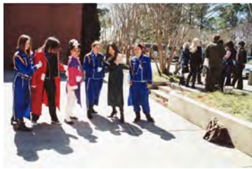
Anime Club Page 3