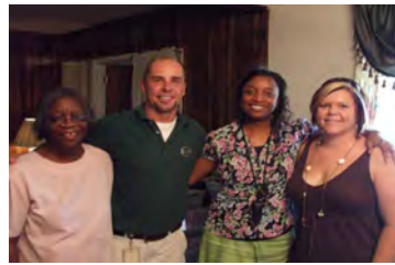
Project Graduation Page 5